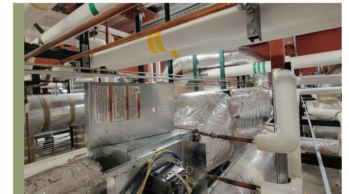
HVAC Installation work at JBER

Aleut Patrick Mechanical is headquartered in Fairbanks, Alaska and primarily installs complex mechanical or utility systems for commercial customers in the Fairbanks North Star Borough. APMH's focus has been expanding their customer base beyond Fairbanks and recently has been working on renovation projects for the barracks on Joint Base Elmendorf Richardson in Anchorage, AK. Fort Wainwright army base, Holland America along with University of Alaska Fairbanks, and Fairbanks Memorial Hospital, are some of APMH's largest customers in the Fairbanks area.