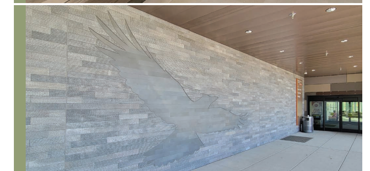
Renovation Project at the Chief Andrew Isaac Health Center (Fairbanks, AK)