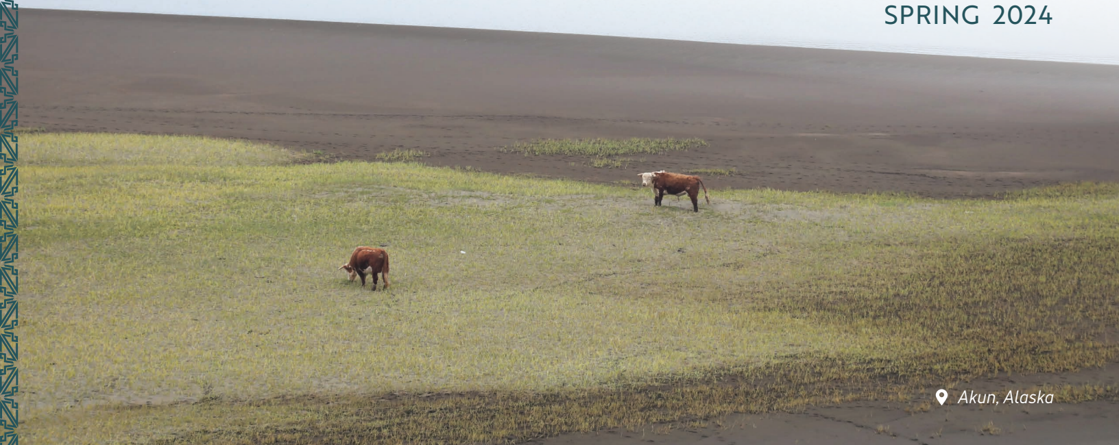
📍 Akun, Alaska