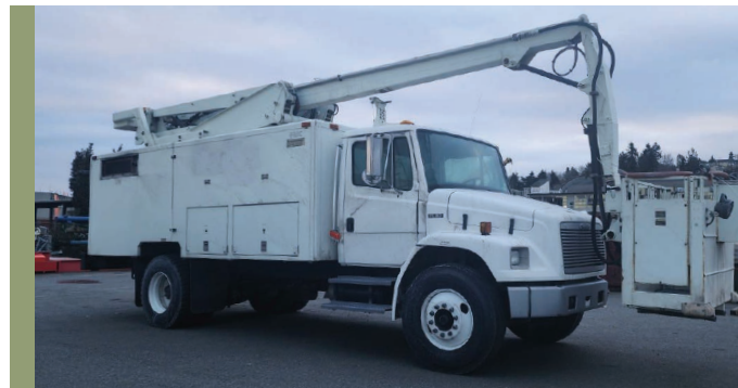
AE's New De-icer will be in action this winter.

This year, Aleut Enterprise is also working to secure additional fuels trucks in the Cold Bay and Adak communities as back-up in case of mechanical issues. These are large investments, but critical to the individual communities. More updates to come regarding the additional fuel trucks.