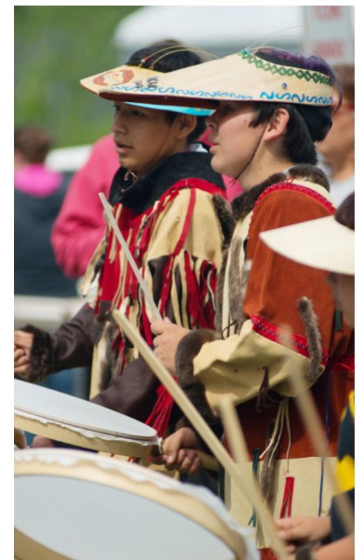
Urban Unangax Youth Dancers perform at the 2016 Annual Picnic

The Aleut Foundation provides an Advanced College Credit Scholarship for those students taking college courses while in high school. We have had two students who, when they graduated high school, also earned their Associate's degree. Call the Foundation for more information.