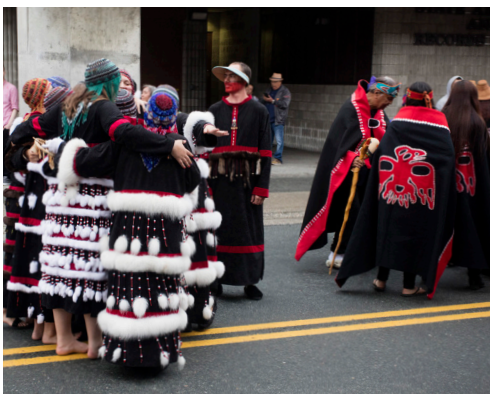
A few Aleut Corporation shareholders participated in Celebration 2016 in Juneau, Alaska in early June. Above, the Kodiak Alutiiq Dancers prepare for the Grand Exit.