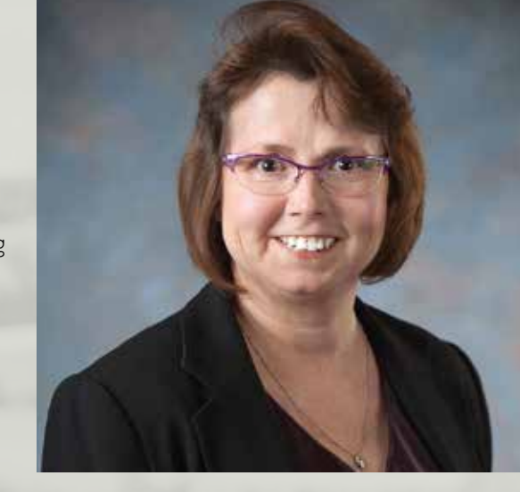
Corporation achieve its strategic and business objectives to the benefit of all shareholders.

The Board also reviewed and adjusted the Board Fee policy, increasing the daily board fee from $450 to $600 and adding a $1,000 monthly stipend for board members. Additionally, the board removed the travel stipend benefit. This is the first adjustment to board member compensation in nearly 15 years and was adopted after reviewing board fee policies from 11 Alaska Native regional corporations. Even with the new changes, the Aleut Corporation fees rank 11th compared to the 12 other regional corporations. A strong, committed Board of Directors is critical in helping The Aleut