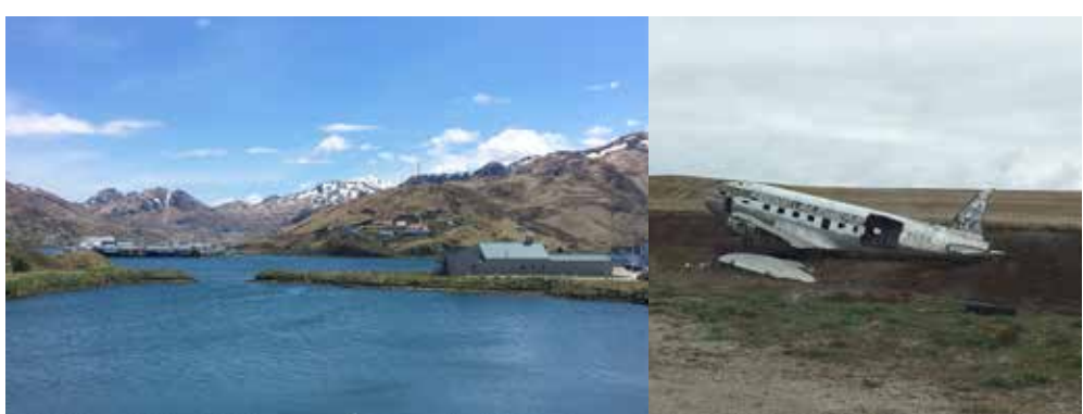
Left: Margaret's Bay, Unalaska Right: old Reeve's plane, Nikolski

One of the many highlights during this visit was to personally recognize