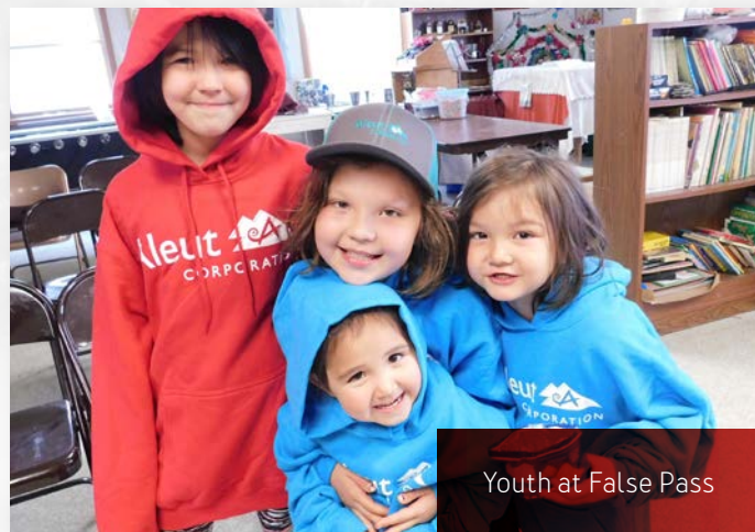
Youth at False Pass