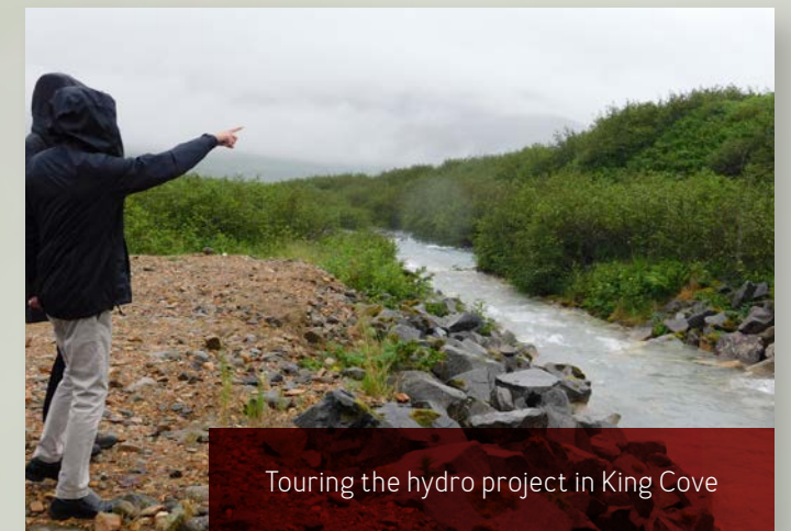
Touring the hydro project in King Cove