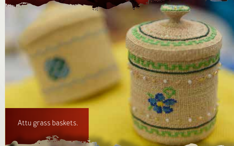
Attu grass baskets.