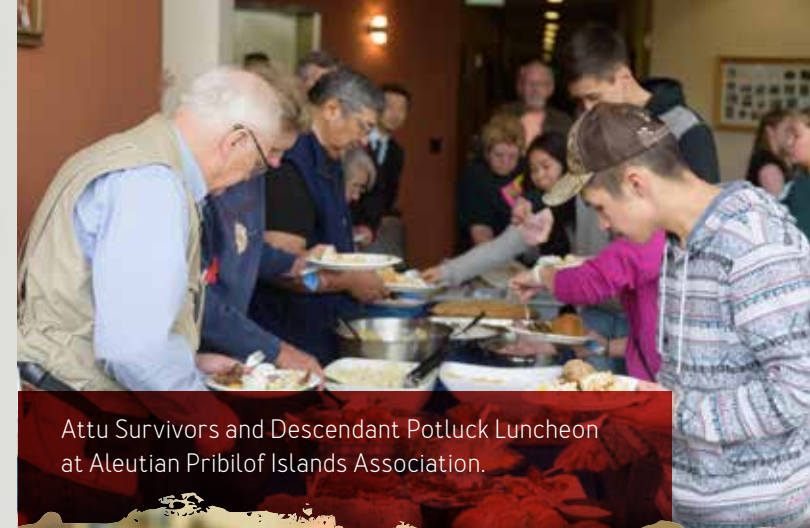
Attu Survivors and Descendant Potluck Luncheon at Aleutian Pribilof Islands Association.