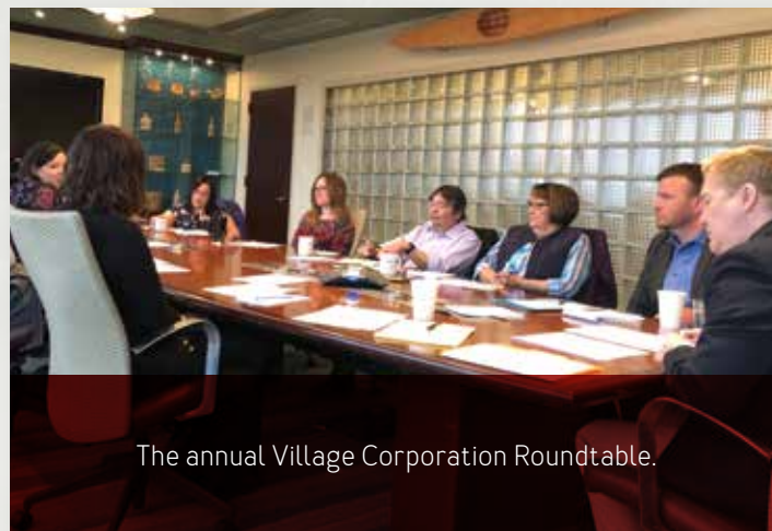
The annual Village Corporation Roundtable.