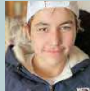
Boston March 10th Grade, Sand Point, AK