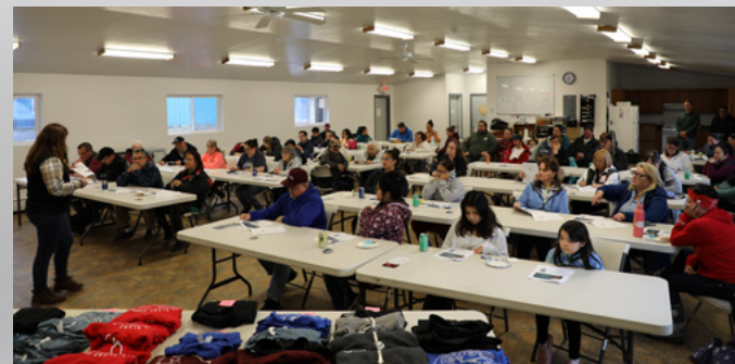
King Cove Shareholder Meeting.