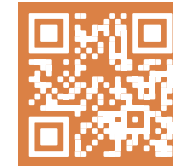
Scan the QR Code to RSVP for the Annual Meeting