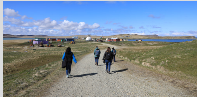
Aleut Team in sunny Nikolski.

Our Summer 2024 community travel was a huge hit! It was so great seeing our shareholders and being back in-region. Congratulations to the winners who won round trip tickets to our upcoming Annual Meeting of Shareholders in Anchorage, we'll see you in October! We are happy to share a few highlights from our visits.