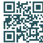
Scan for Voting Instructions

For more information on voting procedures, deadlines, and prize details, please visit our voting information webpage by scanning the QR code below or going to aleutvote.com .