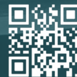
Scan the QR Code for more information

Be sure to read about each semifinalist's business concept in the 2024 Annual Report!