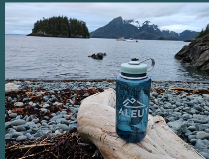
Aleut water bottle in Prince William Sound.

Email your high-resolution photos to comms@aleutcorp.com .