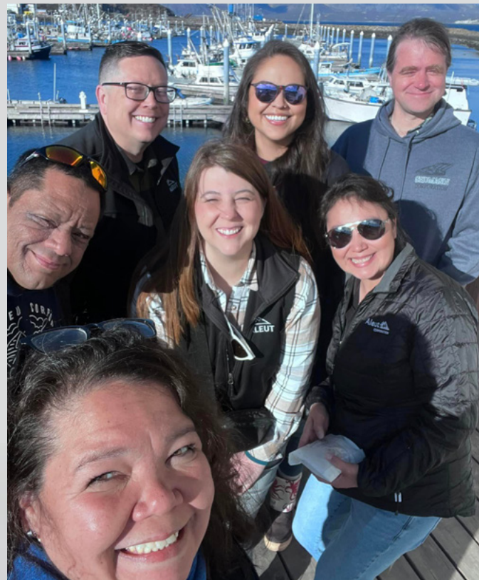
Aleut Team in Sand Point.